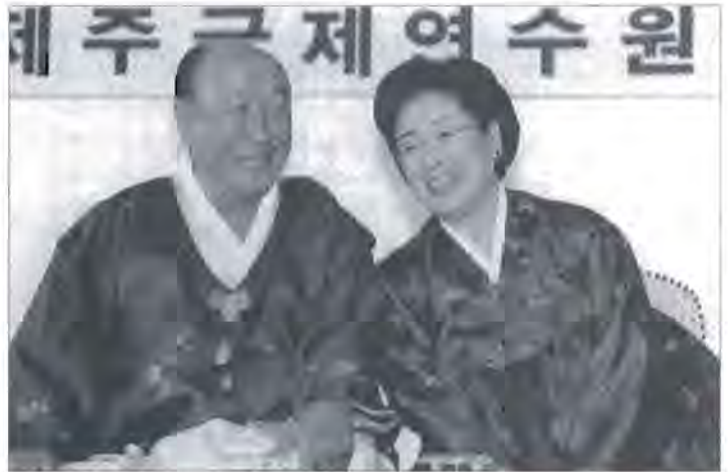
True Parents during the Korean Hoon Dok Hae tour '98.

In the future, will decent people including young people of the world want to hear True Parents' words via the Internet, or some politician's propaganda? (Father's words.) Twenty-