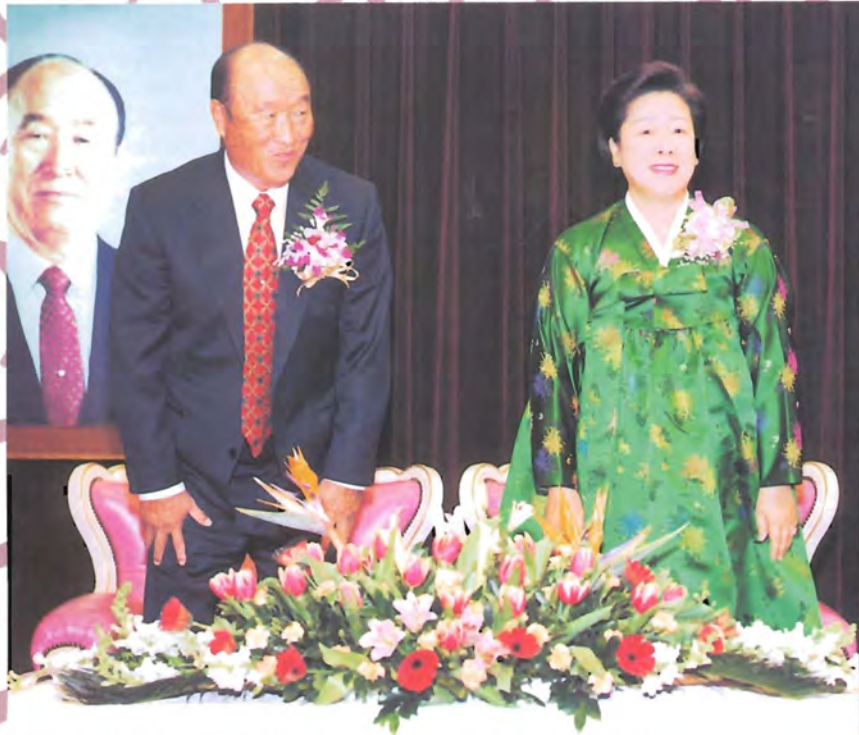
TRUE PARENTS' BIRTHDAY, FEBRUARY 2, 1998.