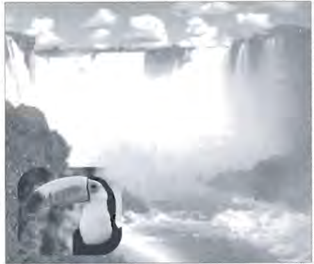
View of an Amazon waterfall; (inset: an Ecuadorian parrot).

American tour. But what I remember most are the times that True Parents have been on the farm. I remember standing alongside other members in the early hours of the morning holding a stick with a flame to give light as True Parents crossed the river and sitting at the feet of True Parents after Pledge or late in the evening. I remember spending time as a driver at Salobra Hotel, where True Parents have been fishing, working at night on the construction while Father walked around checking the progress, or the holy day spent with True Parents at their house in Salobra. I knew these moments to be precious and yet each time I was close to True Parents, I began to feel more and more that as our time comes to an end in this world, it will not be the time we spent with True Parents that counts, but what