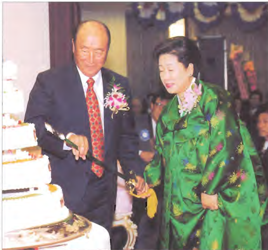
True Parents' Birthday on February 2, 1998 in Seoul, Korea.

and night. Fallen people have stolen everything from God—people, wealth and assets—and used them like thieves. Once you cut off the satanic lineage, you have to return everything to God. Originally, Adam and Eve were supposed to reach the perfection stage without falling, going beyond the perfection level of the growth stage and marrying with God's blessing. But through the fall they were taken away by Satan, and all the wealth of the world has also been kept under satanic dominion. However, through the Blessing given by True Par-