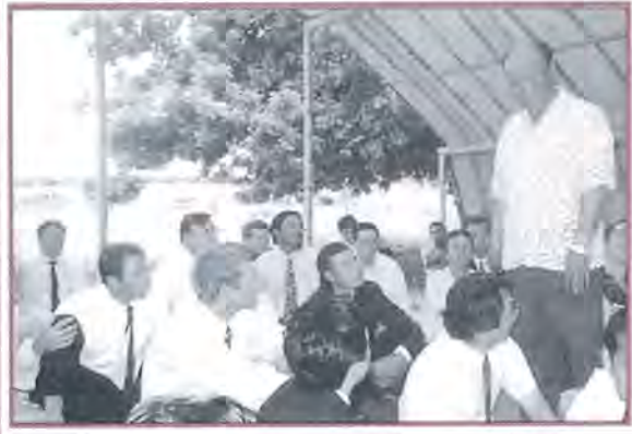
Father talks to the members after Pledge Service. New Hope Farm, Brazil.

This backfired because when the people see an ambulance, regardless of whether it has a Unification sign or not, they speak of it as being an ambulance given by Rev. Moon, knowing that the authorities had taken the Unification markings off. This actually leaves the impression that we have given more ambulances than we actually have.