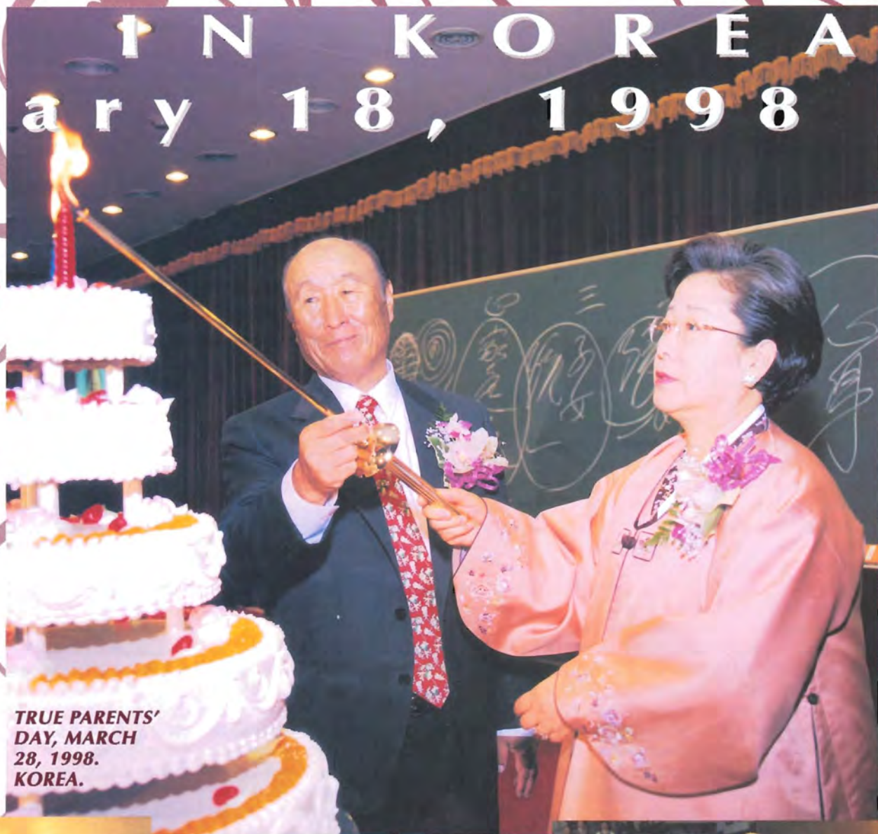
TRUE PARENTS' DAY, MARCH 28, 1998. KOREA.