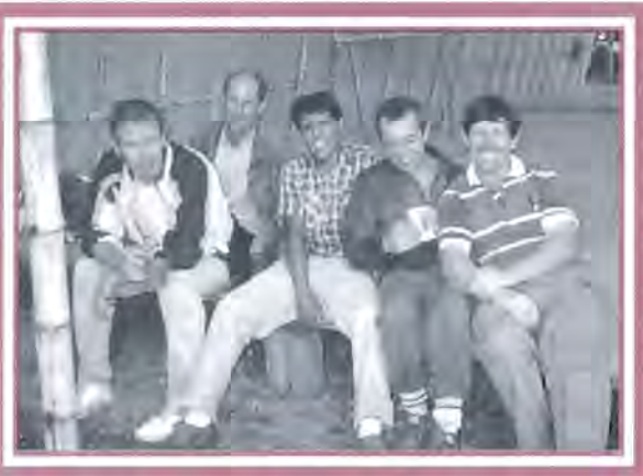
British, Canadian, Argentinian, Italian, Australian.

Father is not only investing on the farm itself but in the whole of the surrounding region (Matto Grosso do Sul). Father has already given one ambulance to each of the 33 towns in the area. A few of these towns did not accept the ambulance and a few of those who had accepted took the Unification sign and Rev. Moon's name off the ambulances.