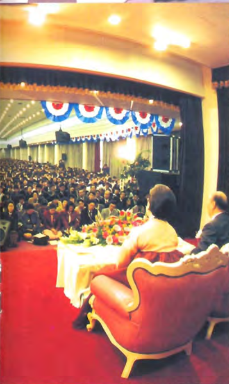
THE HOON DOK HAE AS PART OF SERVICE.