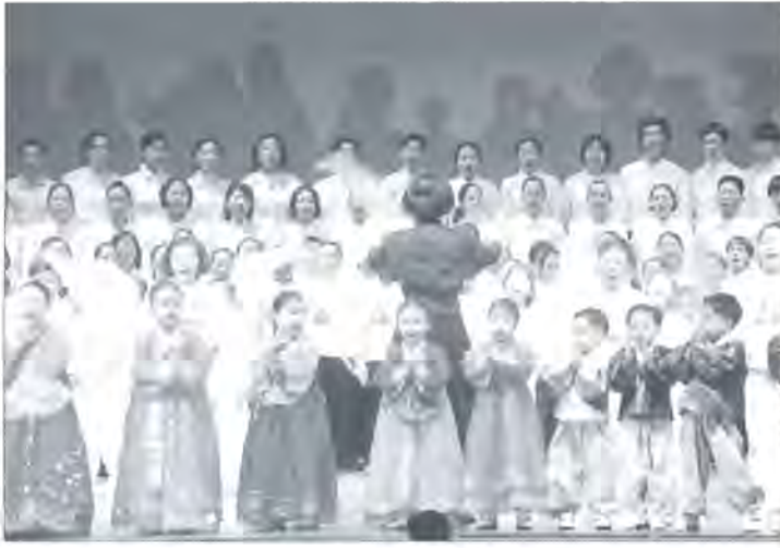
Evening Performance on True Parents' Day.

beings as man and woman. The strong chain by which these opposites are connected is the chain of love. This chain is so strong that the things that are connected by it cannot ever be separated. They will all automatically follow the engine to which they are connected by this chain. Is this true? Unification blessed couples are like a long locomotive train connected together by this love chain, centering on True Parents in the position of engine.