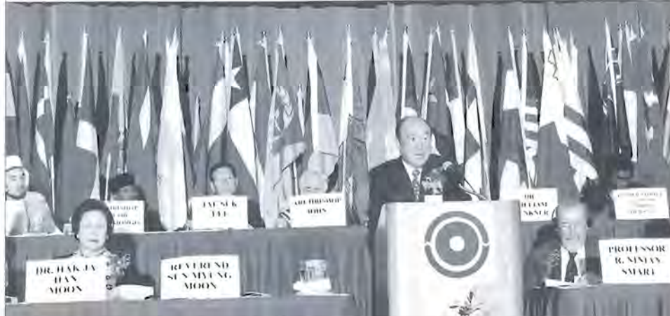
Reverend Moon addresses Congress participants at Opening Plenary.