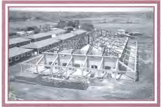
New construction site.

I think a better name at present for the New Hope Farm would be "New Hope Construction Site." By the end of this year we will have enough houses completed to sleep 600 or more people comfortably, a hall that can hold over 3,000 people or more, a two-store restaurant, a university complex consisting of six buildings—each with six large classrooms. The university will be connected to Bridgeport Univer-